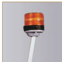
Post-Mounted Safety Strobe