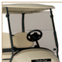
Hinged Windshield (Villager 4)