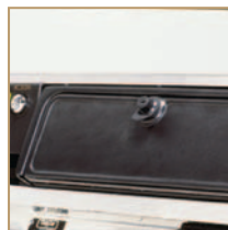
Glove Box With Lock