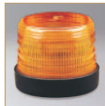
360° Safety Strobe