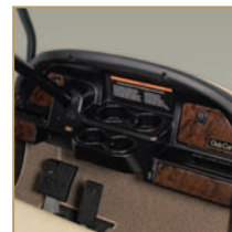
Custom Dash for Villager 4