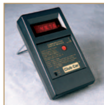
Communication Display Module