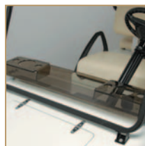
Custom Dashboard Trays