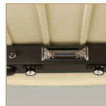
Deluxe Overhead Stereo Console