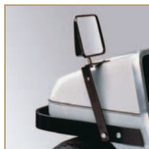
West Coast Mirror/ Heavy-Duty Bumper