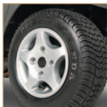
10-Inch Aluminum Alloy Wheels (Villager 4)