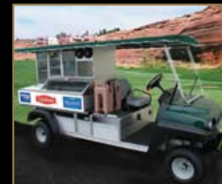
Café Express Deluxe For 25,000 or more rounds of golf per year