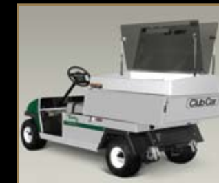
Portable Refreshment Center For 10,000 or fewer rounds of golf per year