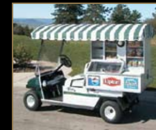
Café Express For 25,000 or fewer rounds of golf per year