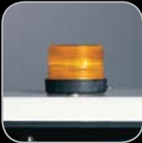
Safety Strobe Light