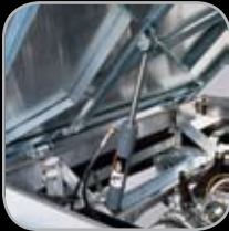
Electric Bed Lift