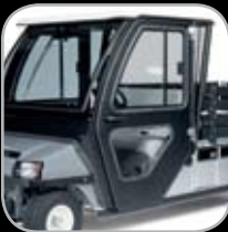
Certified ROPS Cab Enclosure