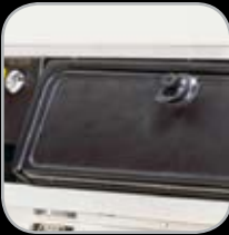
Locking Glove Box