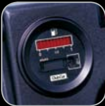
Fuel Gauge and Hour Meter