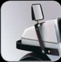
Heavy-Duty Bumper/ West Coast Mirror