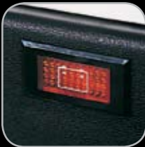
Battery Capacity Indicator