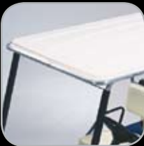
Canopy Top White