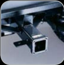
2-Inch Rear Receiver Hitch