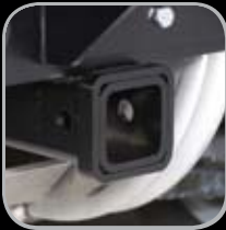
2-Inch Front Receiver Hitch