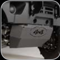
Front Steel Skid Plate