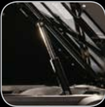
Electric Bed Lift