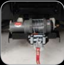
2,500 lb Warn Winch