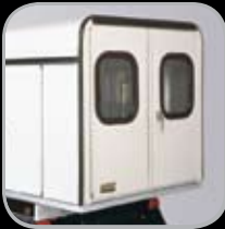
Custom Van Box