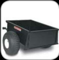
Swisher Dump Cart