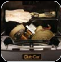
Underhood Storage (Gas Only)