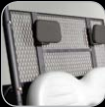
Rear Cargo Cage