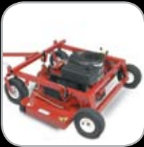
60-Inch finish cut mower