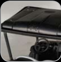
Plastic Canopy Top