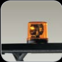
Roof-mounted Strobe Light