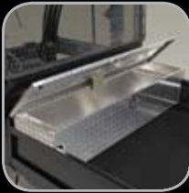
Cargo Bed Toolbox