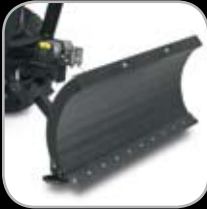
54- or 62-Inch Plow Blade