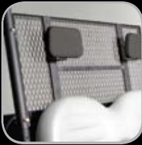
Rear Cargo Cage